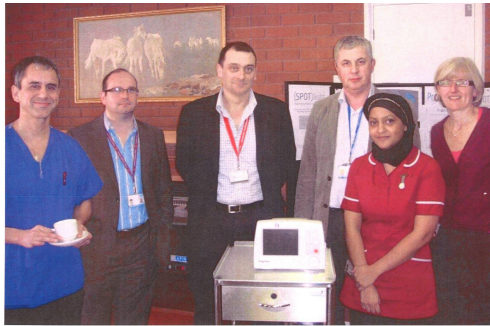
ProMISe Team, Kettering General Hospital